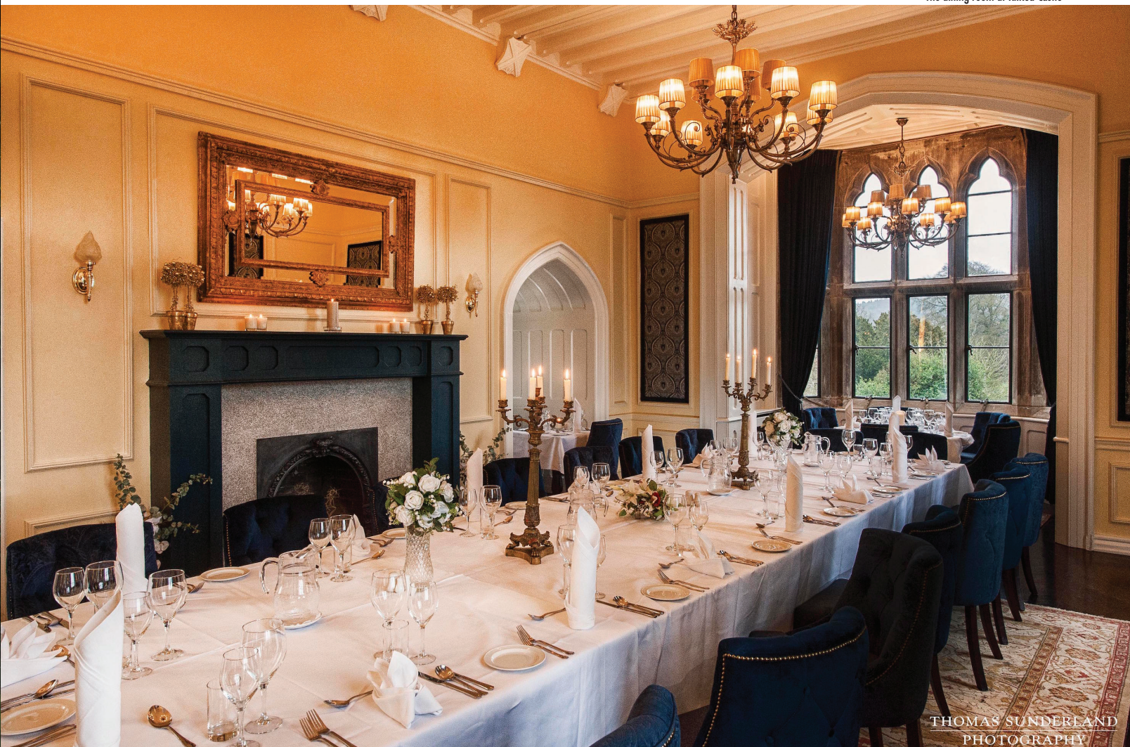
The dining room at Kilkea Castle